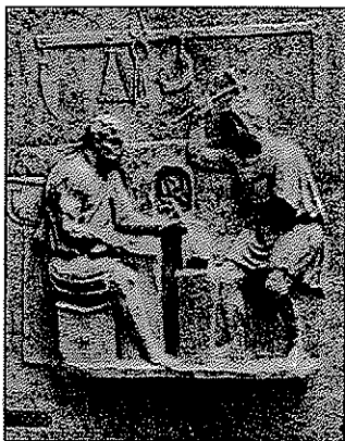
Ancient environmental impact. One source of air pollution by heavy metals.

Although many ancient mines in Central Europe were reopened beginning around the 11th century A.D., it was the development of large furnaces with tall stacks during the 16th century that drastically extended the sphere of influence of smelters and industrial installations (5). The Industrial Revolution brought about unprecedented de-